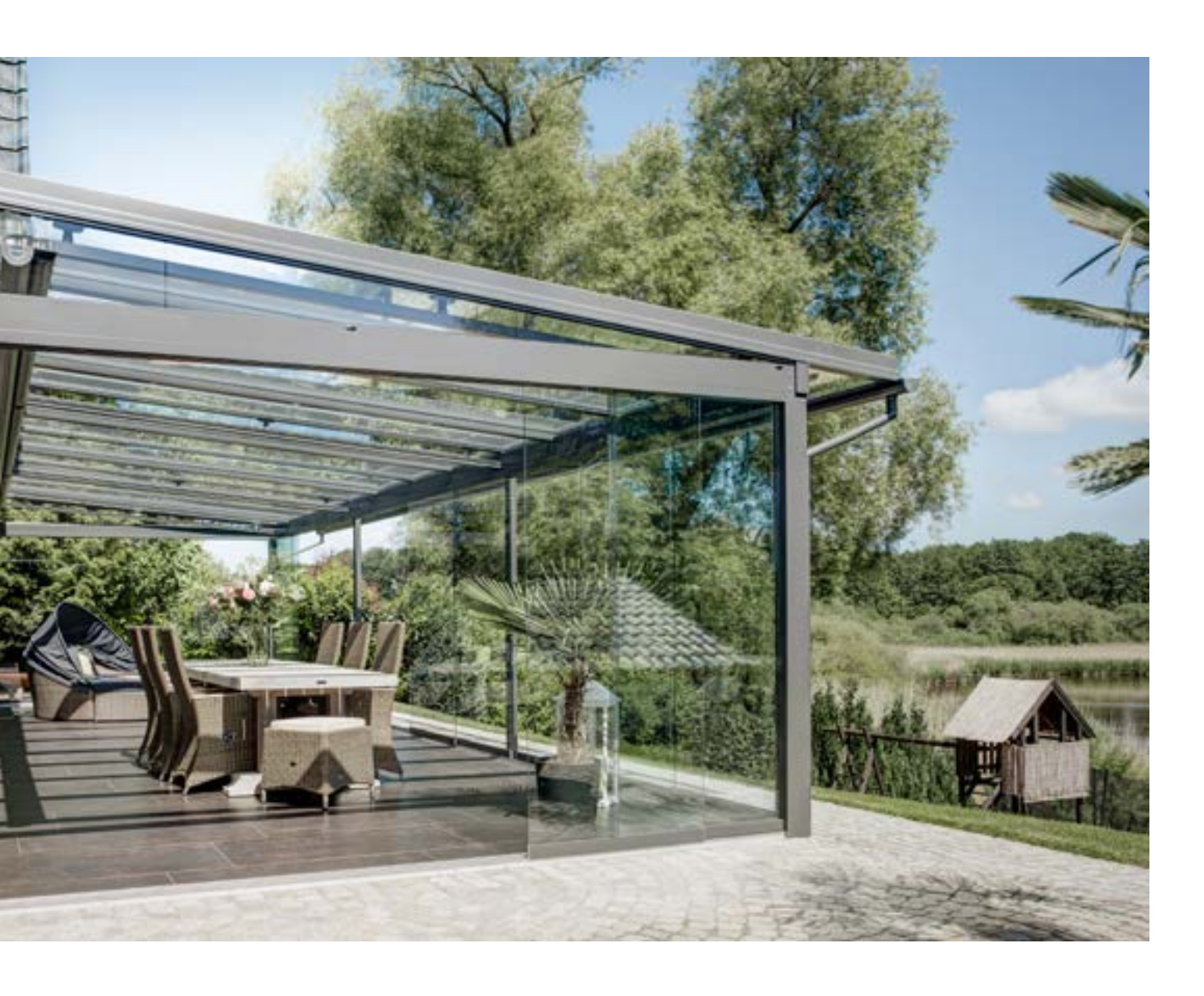
PROJECT Detached house | Schleswig-Holstein, Germany