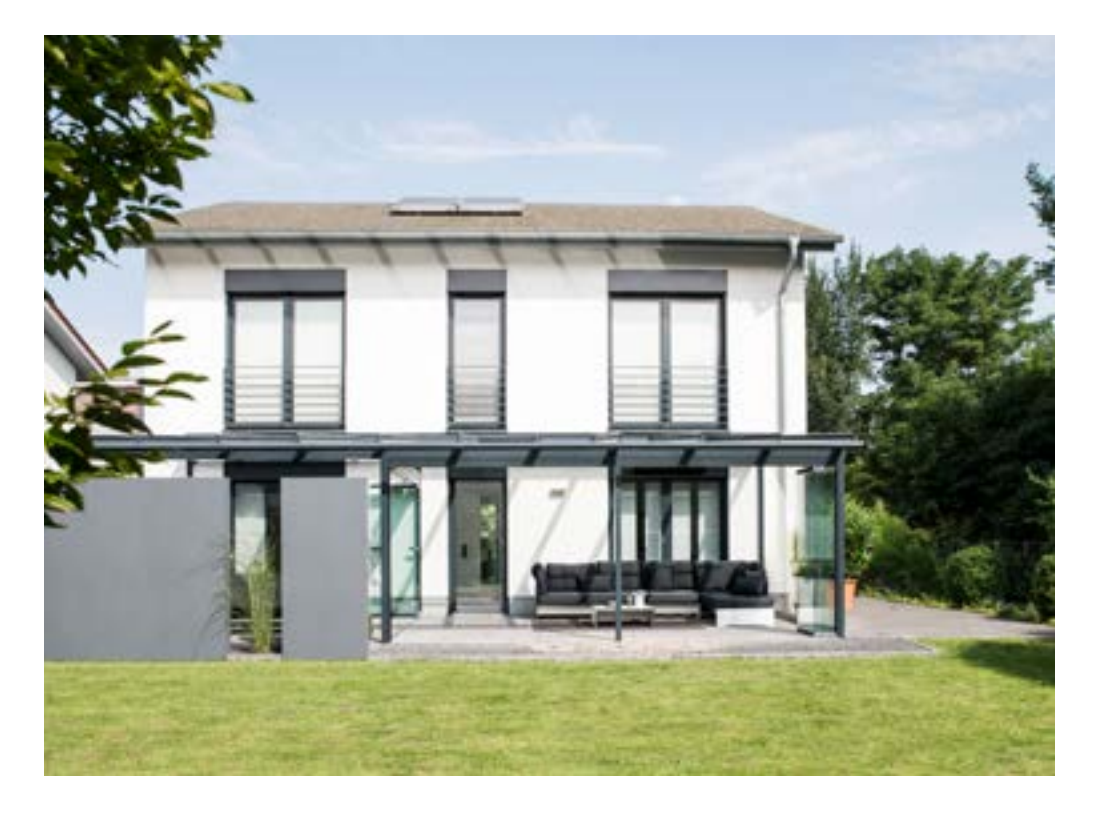
PROJECT Detached house | Rheda-Wiedenbrück, Germany